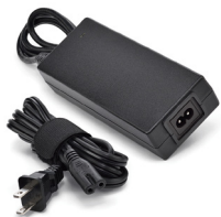
Mains AC power supply unit

Replacement power supply unit that connects the machine to the mains power supply. Supplied with UK plug.