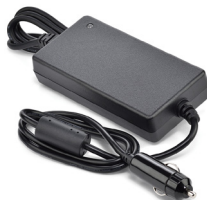
DC power cable

Replacement power supply unit that connects the machine to a 12v socket