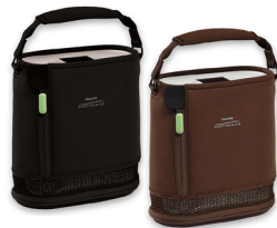
Carry bag and shoulder strap

Stylish protective carry bag available in black or brown