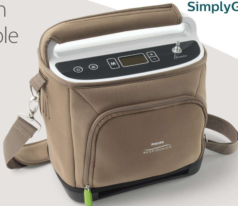
Easy to use control panel with backlit LCD display.

SimplyGo comes complete in a stylish brown bag with shoulder strap together with a large wheel cart and accessory bag ideal for keeping all accessories and cables together.