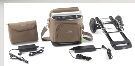
▲ The SimplyGo comes complete with a trendy carry and accessory bag to keep all power cables and other accessories neatly together. A large wheel cart is also included for easier transportation.