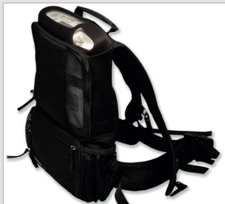
◀ Backpack accessory is also available for the G3.