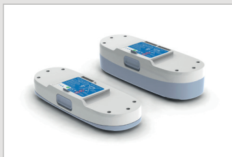
◀ The INOGENONE® G3 has two battery options: 8 cell & 16 cell. The battery re-charges when installed and the machine is connected to mains or DC power. A desktop charger is also available to charge any supplementary batteries. (optional accessory)